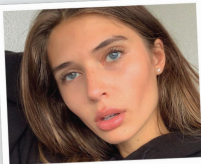
Volumizing Brow Filler

with the kind of self-love you deserve. Babe Lash was created to make you feel confident in your own skin with products that are designed to enhance your unique features.